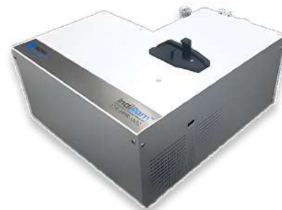
IndiRAM™ CTR- Mini Series