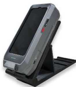
IndiRAM™ Handy Series