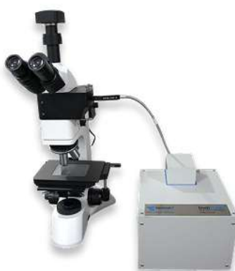
IndiRAM™ CTR P-Series