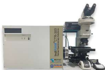
IndiRAM™ CTR Series