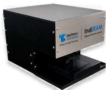
Diamond Detection System