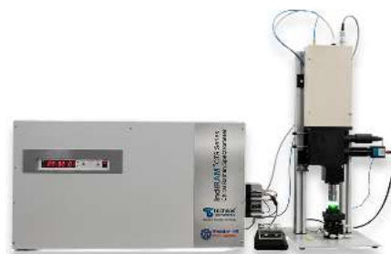
IndiRAM™ CTR Series Chiral Raman Spectrometer