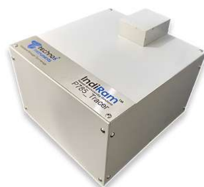
IndiRAM™ Portable System