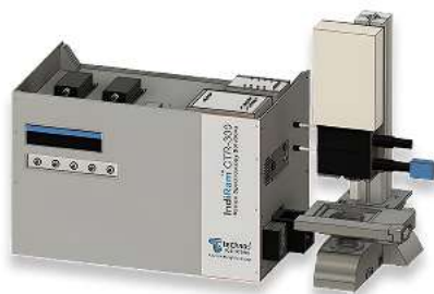
IndiRAM™ CTR for Quantum Characterizer