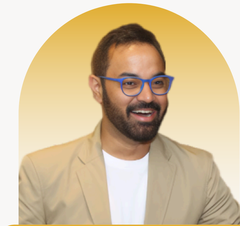
Sumit Sir MBA SPJIMR