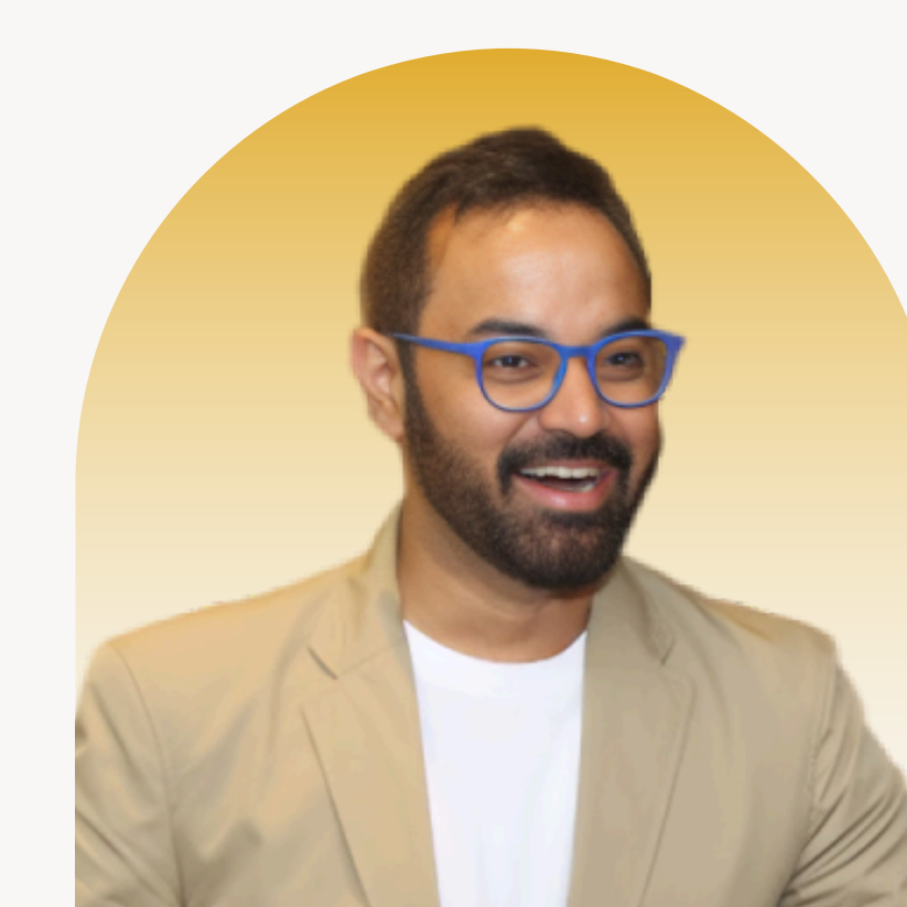
Sumit Sir MBA SPJIMR