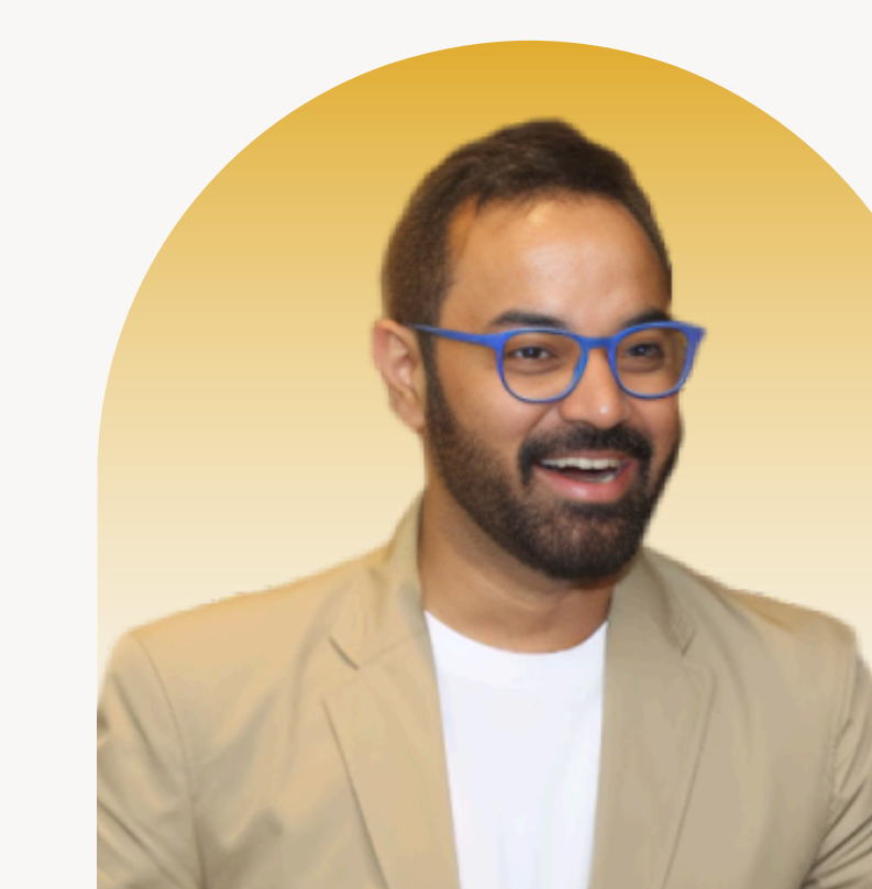
Sumit Sir MBA SPJIMR