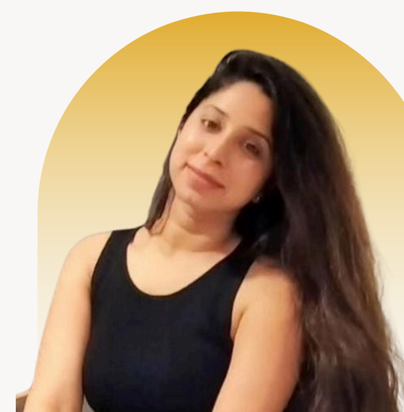
Megha Ma'am MBA SCMHRD

Doubt Solving Forum: forum.catking.in Session: Mon to Fri @ 6pm