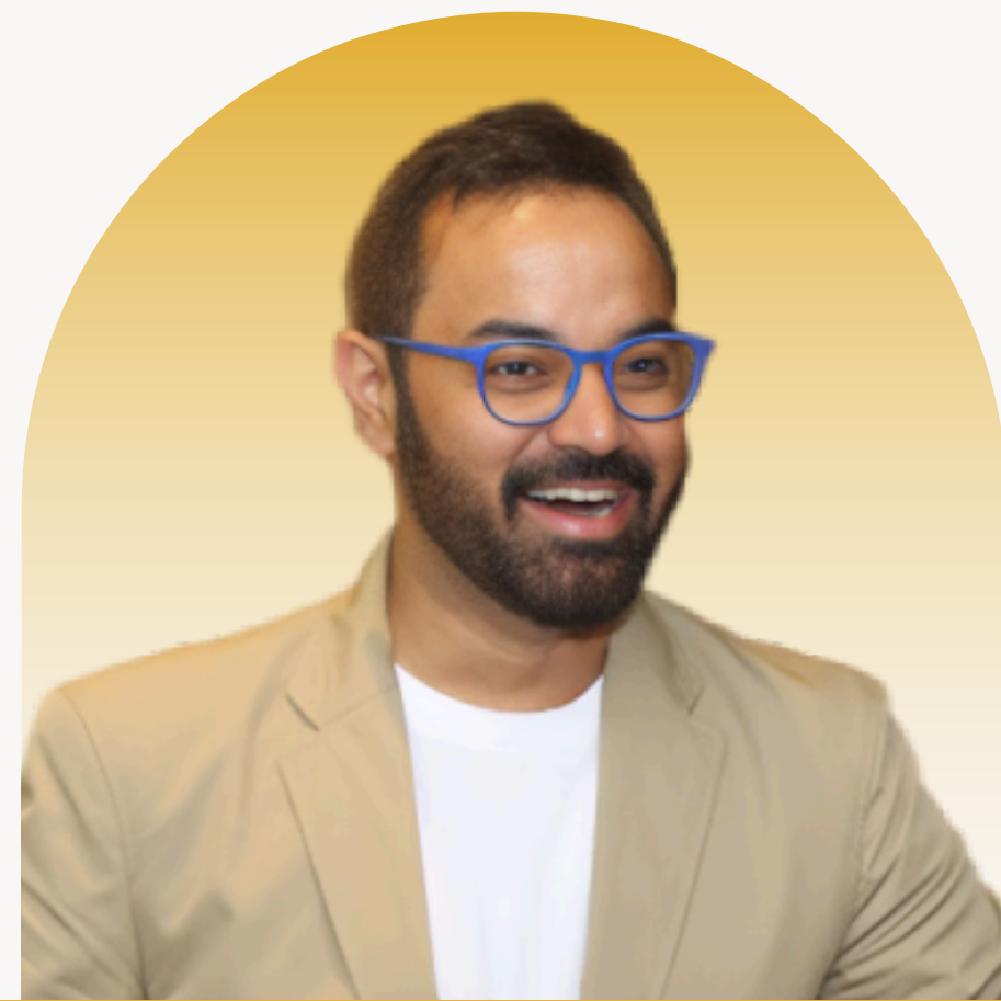
Sumit Sir MBA SPJIMR