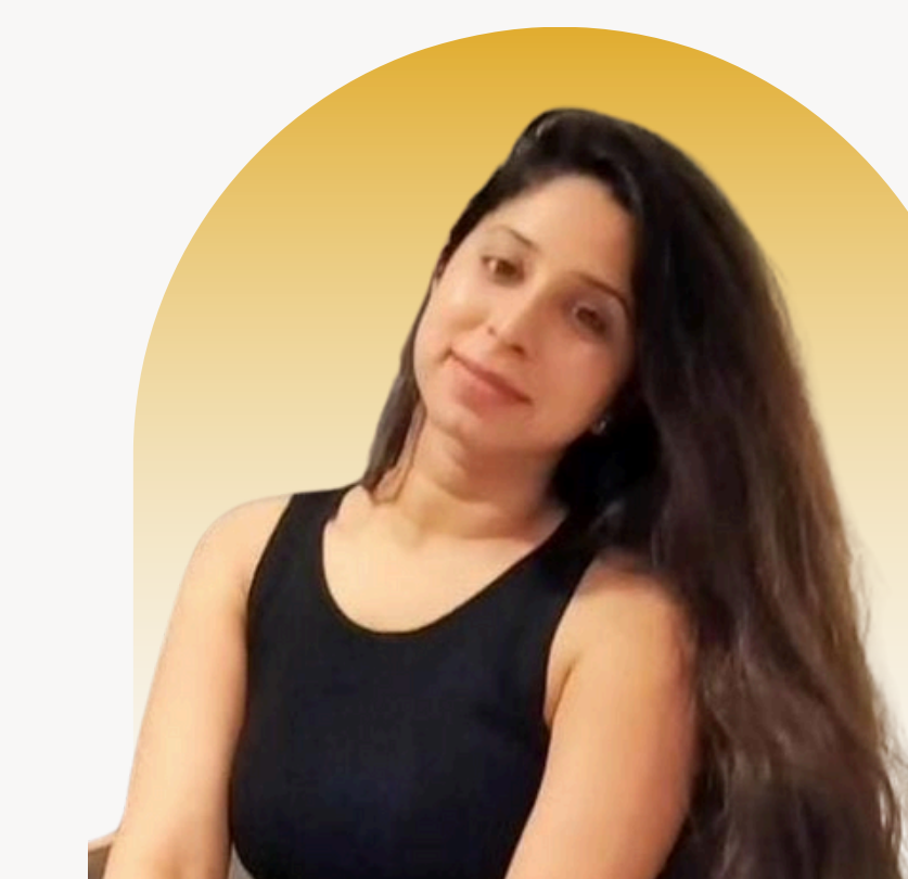
Megha Ma'am MBA SCMHRD

Doubt Solving Forum: forum.catking.in Session: Mon to Fri @ 6pm