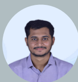
Varad, 96.96%ile, college

I referred CATKing SNAP content to prepare for the SNAP exam, and in my view, it's the most exceptional resource I discovered for SNAP preparation. The CATKing SNAP mocks enhance your comprehension, problem-solving speed, and accuracy remarkably. I highly endorse CATKing for SNAP preparation. Thank you!